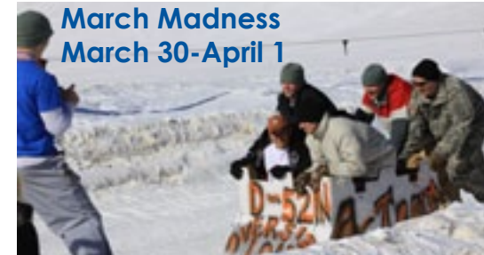
March Madness March 30-April 1

* No personal sleds are allowed on Birch Hill!